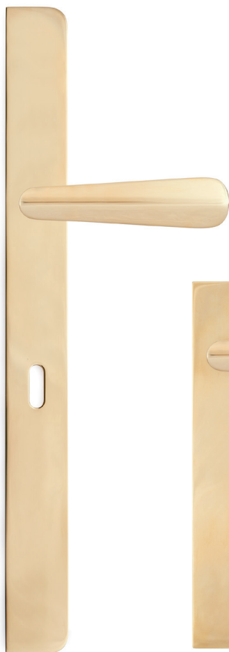
LEVER HANDLE ON LARGE PLATE