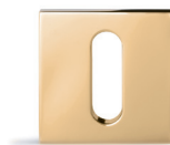
KEY / CYLINDER ESCUTCHEON