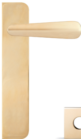
LEVER HANDLE ON SMALL PLATE