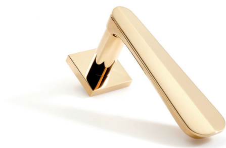
LEVER HANDLE ON ROSE