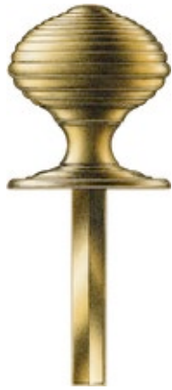
Thumb Turn & Rose