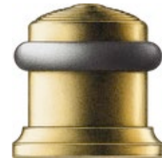
Cylindrical Floor Stop with Trim Ring